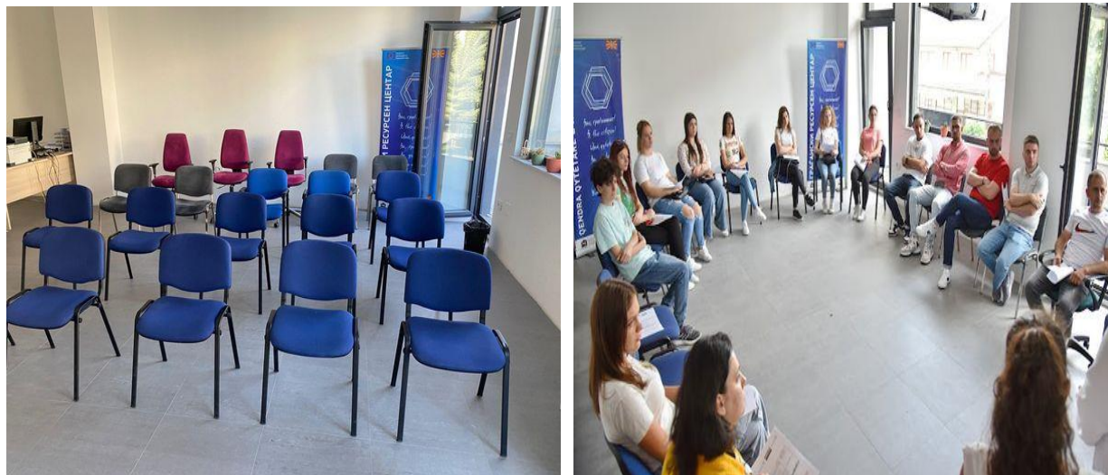
The premises of the Civic Resource Center in Gostivar

The project is financed by the European Union and implemented by the Macedonian Center for International Cooperation (MCIS) in partnership with the Association for Democratic Initiatives (ADI) from Gostivar and Media Plus from Shtip.