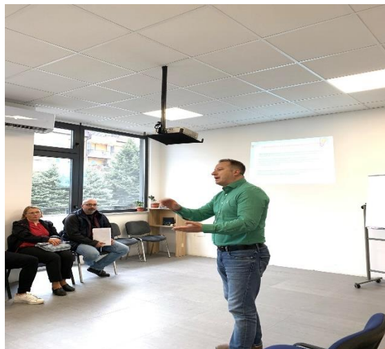
Workshop for e-business

The project is implemented by ADI Gostivar and Association of Mountaineering Sports "Shar", which is implemented within the framework of the Regional Program for Local Democracy in the Western Balkans 2 - ReLOaD2, which is financed by the European Union (EU), and implemented by the Development Program of the United Nations (UNDP).