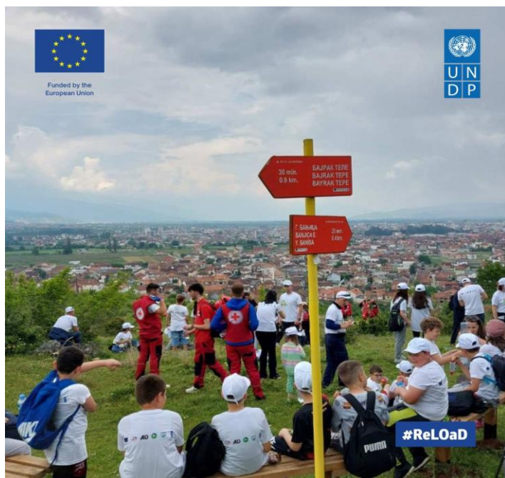
Promotional tour on Bajrak tepe

The citizens of Gostivar municipality got a new neat place for walking and recreation, At a convenient event and with a recreational hike in a group of mountaineers, citizens and students, the newly arranged Bajrak Tepe hiking trail with a length of 3 kilometers was promoted. Apart from walking and enjoying nature, the attendees had the opportunity to familiarize themselves with the features of the trail.