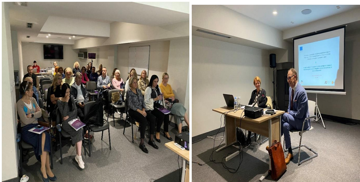
Presentation of the analysis of the type of data collected by the institutions

The project is implemented by ADI and HOPS and financed by the European Union.