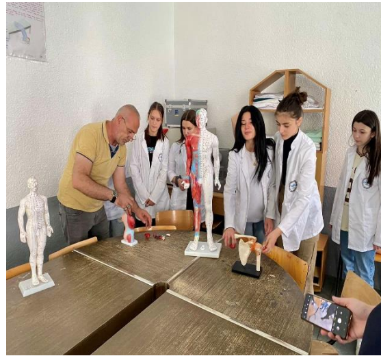
Local actions in Polog region

The project is financed by the grant program of the project "Youth participation for strong and sustainable development of the community", implemented by the Coalition of Youth Organizations SEGA, funded by the EU.