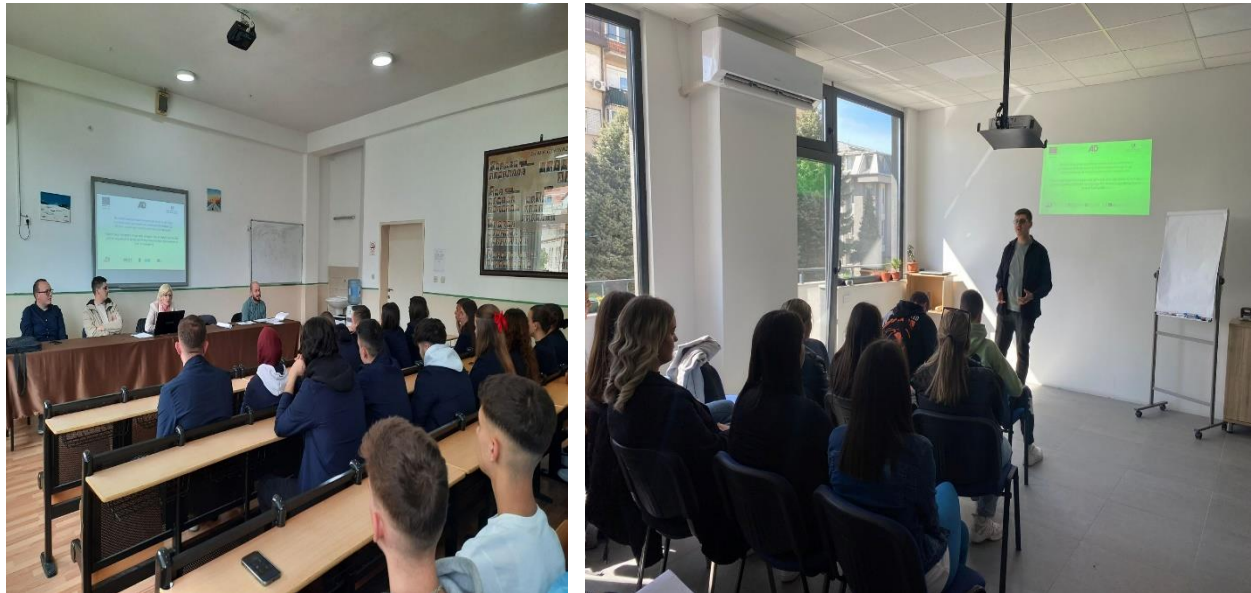
Debates with youth

The findings of the research on the experience and activities of young people from Polog and the level of participation in the community were presented at the debates.